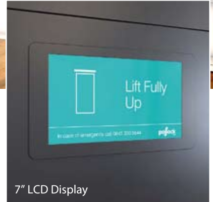
7" LCD Display

To speak to a customer advisor call 01282 699300